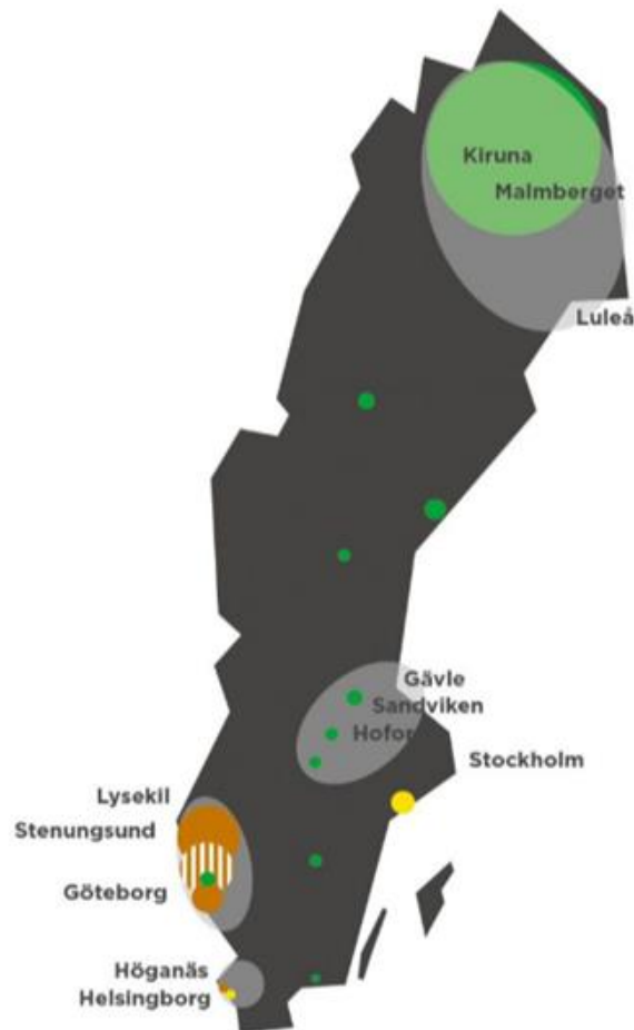
Figure 1: Emerging regional hydrogen clusters in Sweden based on projects and plans as of 2021