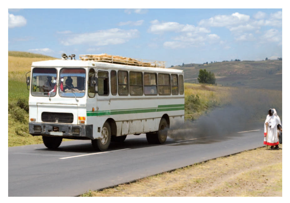
Public transport is good for the climate, but it doesn't have to be bad for air quality.

Several notable success factors may be transferrable to other cases where processes for integrated policymaking are being developed. Nigerian policymakers report that during the process stakeholders gained a sense of ownership due to their capacity to actually influence policy. Furthermore, the mix of both informal and formal meetings was crucial for securing stakeholder acceptance. An extra coordination effort was required when it became clear that stakeholders had proposed more measures than the budget could cover. The steering and oversight of the SLCP CO as the dedicated, clearly designated authority contributed to the success of the endeavour.