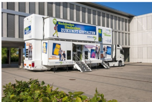
Fig. 2 The new appearance of the Expedition N vehicle after its redesign

Two of the authors (IC and OR) redesigned the Expedition N to facilitate the integration of citizens into the new energy regime of Germany. By using the information terminals of the exhibition, citizens use their own interests and learning process to understand the function of the electricity grid, how they would affect the grid as consumers or energy producers, as well as the dynamics of the smart grid in resource allocation. The smart grid concept is not well understood by most people outside the relevant technology industries; therefore,