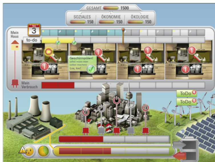
Fig. 8 User interface of electricity consumer

electricity produced and consumed (see Fig. 7), and consumers know their consumption conditions after using certain appliances from their own screens (see Fig. 8). Unlike the traditional grid, the smart grid here in the game makes consumers aware of the whole supply and demand system in addition to their own consumption. When the consumption level is high, the generator either provides more electricity, or a blackout happens, which brings that round of the game to an end. To achieve a better score, groups could play a second or third round. An open discussion on possible ways to balance demand and supply in the virtual city is encouraged