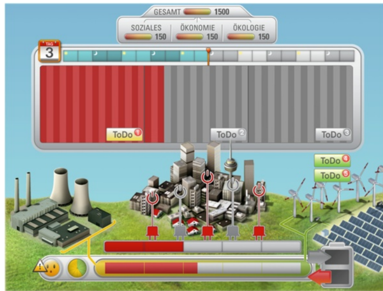
Fig. 7 User interface of electricity generator

individual decisions to use appliances at each moment in their own display. It reminds visitors of their daily consumptions in reality.