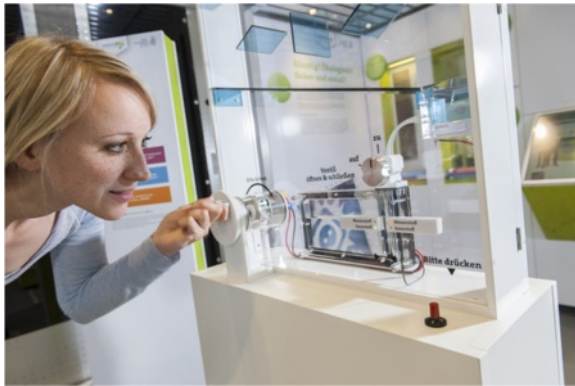
Fig. 5 Oxygen-hydrogen generation and combustion (the "Ping Pong Pinball")

the interactive simulation game aimed to make the idea more accessible and memorable and to stimulate visitors' curiosity and desire to give it a try. The game was designed to increase citizens' awareness and heighten a sense of individual responsibility. Personal responsibility is an important component to engage people in environmental conservation actions, which should be considered well in promoting programs [6]. Generally, museums and science lessons present physical facts about energy technologies, while this mobile exhibition brings out the social aspects of energy issues and the need for collective action. The interactive game can help visitors make better connections between their electricity consumption and personal impact on the energy system, unlike illustrations of home appliance choices, which focus on the efficiency of the device, rather than the actions of the user. Additionally, it allows visitors to experience new roles, such as prosumer with this simulation. By experimenting with