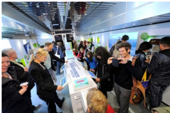
Fig. 10 Big event on the German National Day

The German energy transition is heatedly discussed not only within Germany but also throughout the world. Even if energy technologies are feasible, consumer acceptance and public participation take time to evolve.