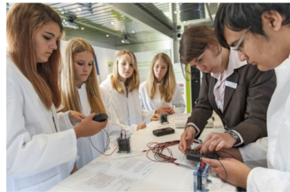
Fig. 3 Dye-sensitized solar cell experiment

More interestingly, visitors can freely choose and change roles in the energy system—consumer, supplier, or regulator—enabling them to see divergent views on particular topics and interact virtually with the other roles. In the energy transition, the three roles might face dissimilar aims, challenges, and tasks for energy production, consumption, and storage. Visitors could identify with a specific role and learn corresponding options and impacts on the energy system. In reality, everyone has a role in the energy system, but being aware of other standpoints and responsibilities could put citizens at ease when dealing with the unknown future. For group visits, especially for school students, the tour supports