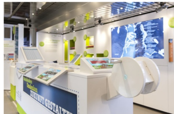
Fig. 1 Smart grid game platform