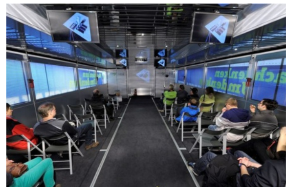
Fig. 4 Film presentation room on the second floor